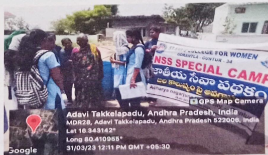
NSS volunteers participated in awareness program on water pollution